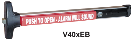
V40xEB (Shown with factory installed mortise cylinder - sold separate)

The V40xEB is designed for primary and secondary exits that require an alarmed panic device . The 100dB alarm will sound when someone attempts to exit, alerting management to the unauthorized exit. Available in various configurations, the V40xEB provides security while meeting all life safety concerns, offering an exceptional value.