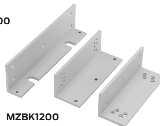
MZBK1200 Z bracket