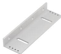
MLBK1200 L bracket