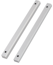
MFP50 and MFP63