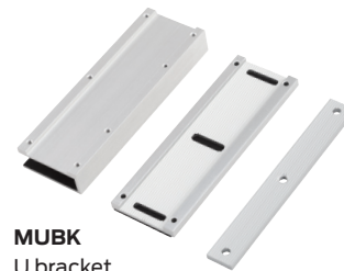
MUBK U bracket