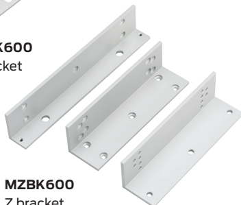
MZBK600 Z bracket