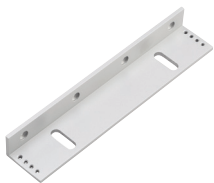
MLBK600 L bracket