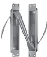
PTM see page 81