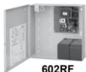
602RF see page 61