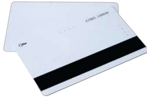
MT-10X Multi Technology Proximity Card

Keri Proximity Credentials (including Cards, Tags, and Patches) can be used interchangeably on the same system without worry about ID code duplication or format matching.