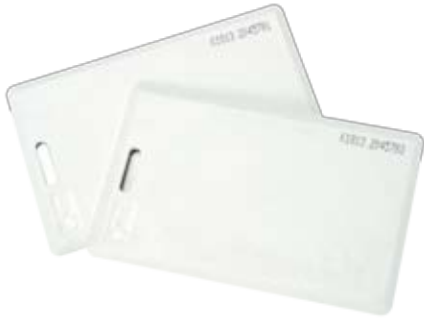
KC-10X Standard Light Proximity Card