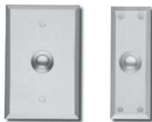
451 451N 452 452N 453 453N